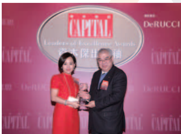
Capital Leader of Excellence Awards 2015

In comparison with banks, licensed money lenders offer loan services with greater flexibility in terms of proof requirements, loan sizes and types of collaterals, hence providing potential borrowers with an ideal alternative for obtaining financing without complicated application procedures. As part of the efforts to safeguard banking and financial stability, regulatory bodies have imposed credit tightening measures for residential mortgage lending from banks. This presents opportunities for non-bank money lenders, who can provide flexible lending services.