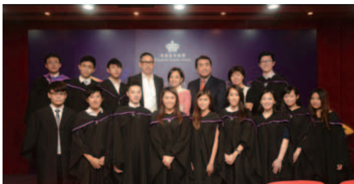
Summer Internship Program 2015