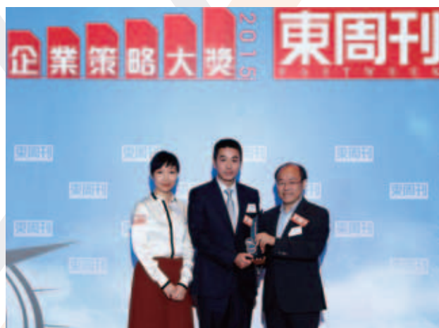
Outstanding Corporate Strategy Awards 2015