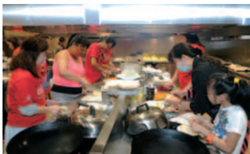
“Cooking Fun” cookery class