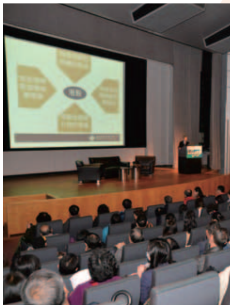
Investment Seminar 2015

During the Year, the Group acted as Joint Bookrunner and Joint Lead Manager in the share offer for the IPO of Global International Credit Group Limited, which was listed on the Main Board of the Stock Exchange in December 2014.