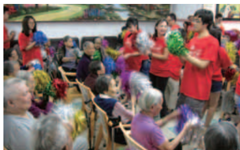
Volunteers visit to Kwong On Home of the Aged in Aberdeen