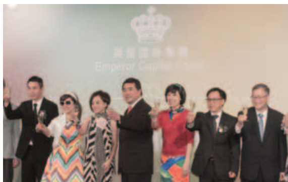
Annual Dinner 2015

The Shanghai-Hong Kong Stock Connect scheme launched in November 2014, followed by a stock market rally in April 2015, spurred a rush of new investors joining the market and resulted in an increase in new account openings. Growth in number of customers, together with the more active securities turnover involved, led to revenue from brokerage services growing significantly by 65.4%, to HK$151.5 million (2014: HK$91.6 million). The segment accounted for 18.1% (2014: 16.8%) of total revenue.