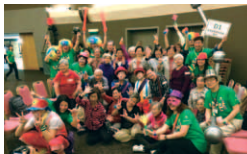
Jade Party 2015